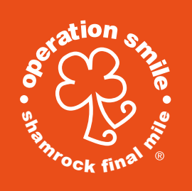
Run 25.2 miles at home or at school, and then run the final mile of the marathon on race day!